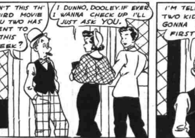
SCORCHY SMITH Trademark Reg. Applied For U. S. Patent Office