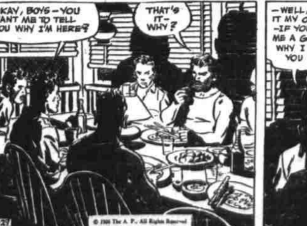
HOMER HOOPEE Trademark Reg. Applied For U. S. Patent Office