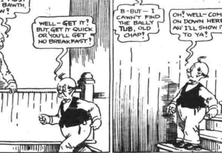
He Walked Into Something