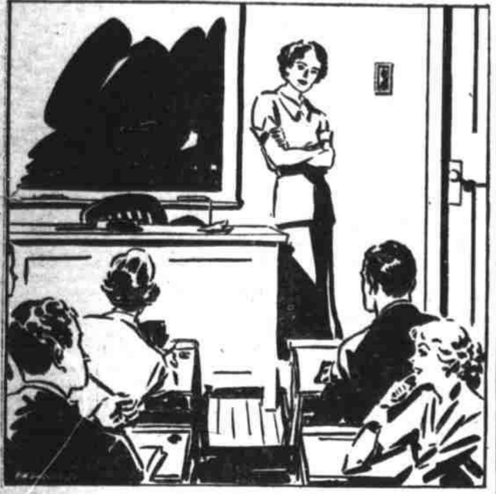
Carol faced her first class.

Chapter Seven THE CAT After supper she and Ellen walked to their home. "What'll we do tonight?" Ellen demanded. "Go to church?" "What again?" "Well, there doesn't seem to be much else."