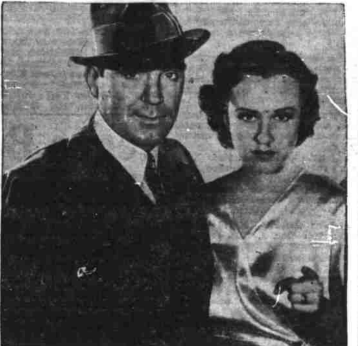
Pat O'Brien and Margaret Lindsay in a scene from "Public Enemy's Wife," a new dramatic treatment of government agents' adventures. In this one, the G-man falls in love with a girl involved in a gang. The picture is at the Lyric Sunday, Monday and Tuesday.