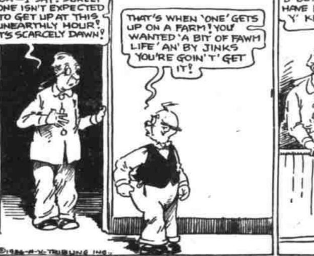
DIANA DANE Trademark Reg. Applied For U. S. Patent Office