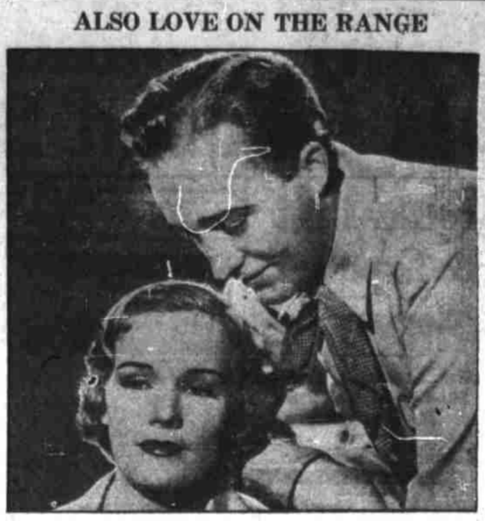
The title of Big Crosby's new picture, at the Ritz Sunday and Monday, is "Rhythm On The Range," but the presence of Miss Frances Farmer in the film with Bing indicates that there also is romance. Bob Burns of bazooka fame and Martha Raye provide comedy.