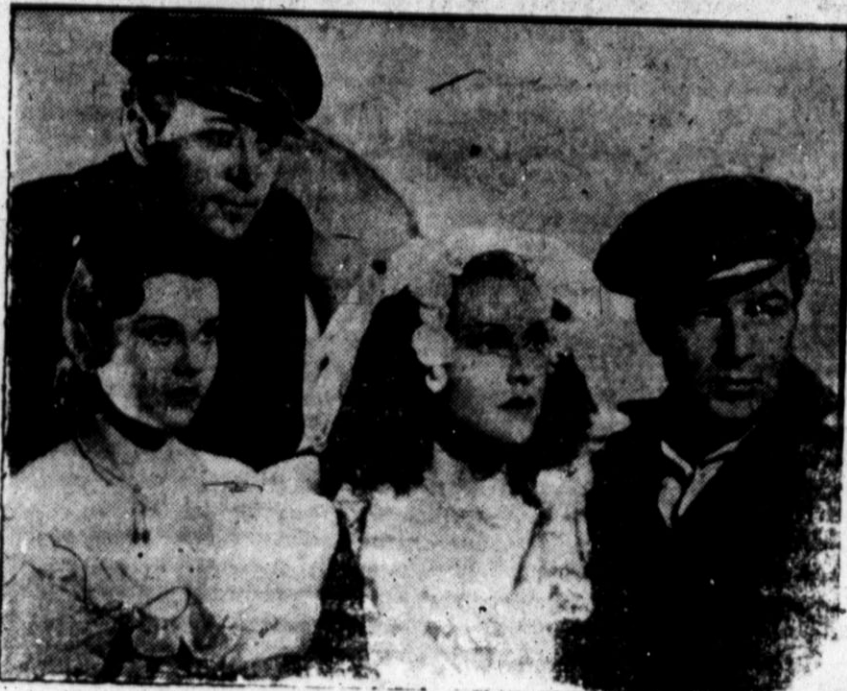
The scene above is from the mighty portrayal of "Souls At Sea," starring Gary Cooper, George Raft, and Francis Dee. The film opens at the Star with a midnight prevue Saturday, and shows through Sunday and Monday.

program, Santa came and with the aid of his helpers, distributed the gifts and treats from the heavily laden tree.