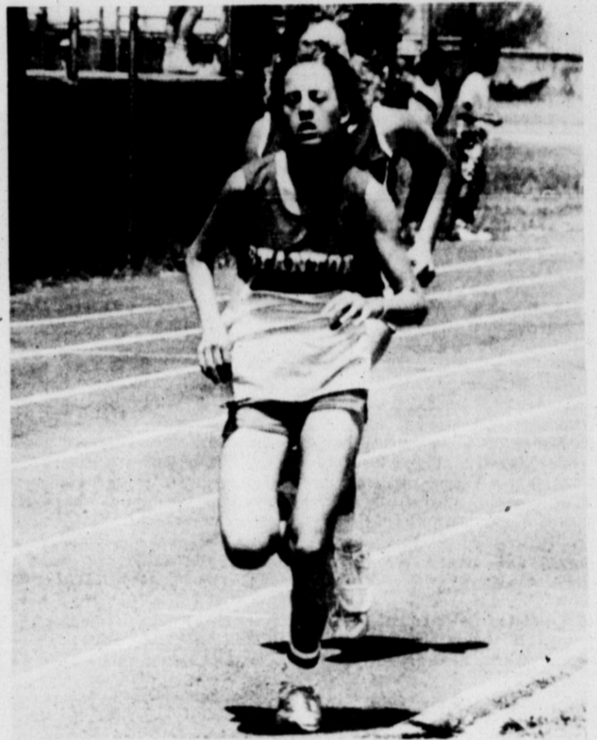
Won 800 and 1,600-Meter Runs