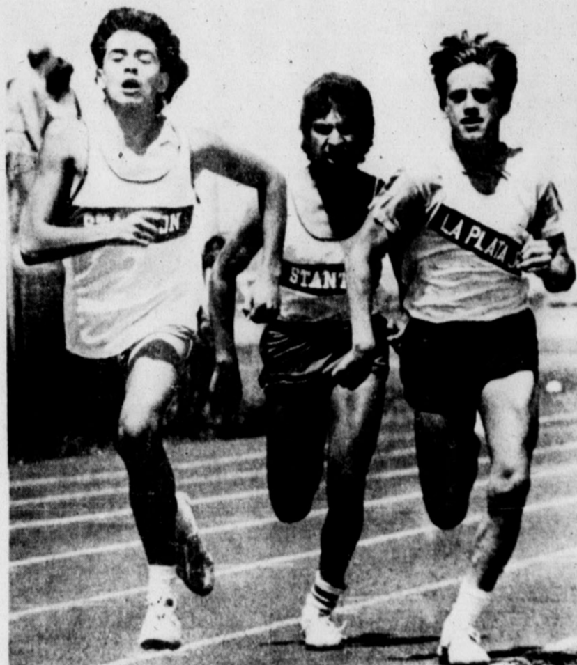
800-Meter Run Participants