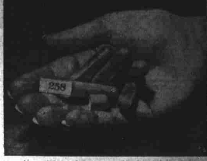
SHAKE WELL BEFORE USING—Uncle Sam' to speed recovery of nation's defense system will be no bearing capsules like these, to be used in a lottery at Wash after Oct. 16, draft registration day. Like the 1917 drawing registrants bearing No. 258 were first group called, will designate which men must report first for

The first Catholic Mass in Bra-Craig, all of Big Spring and Dorengine and the rear wheels. The interesting new-season offerial was celebrated May 1, 1500.