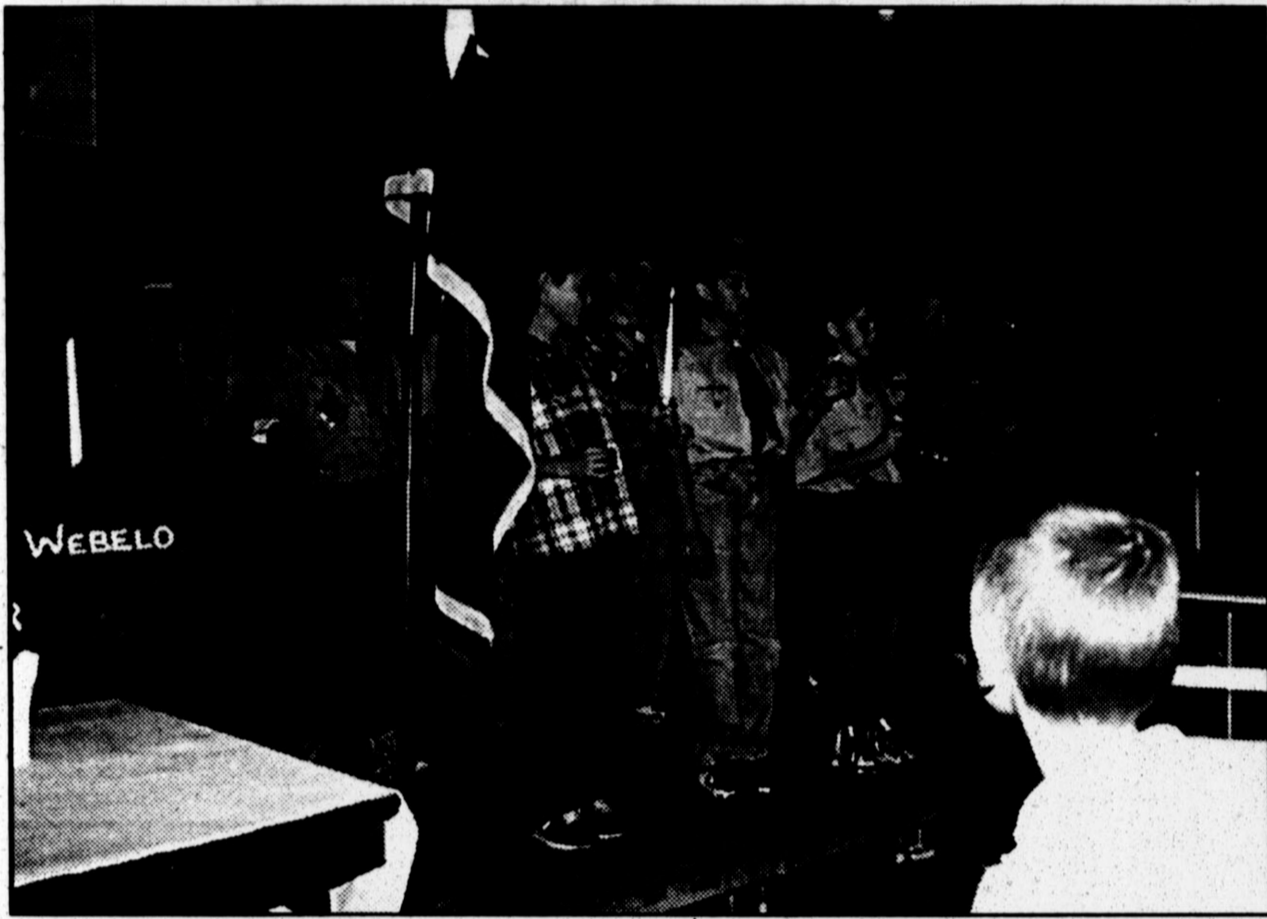
Highlight of Pack 50 Blue and Gold Banquet Saturday evening in Hereford Community Center was the graduation ceremony for the Mountain Man Patrol pictured above. These second year Webelo Scouts crossed the bridge from Cub Scouts into Boy Scouts after receiving their Arrows of Light, the highest award given in Cub Scouting.

HEREFORD BRAND • Wednesday, March 10, 1999 • A3