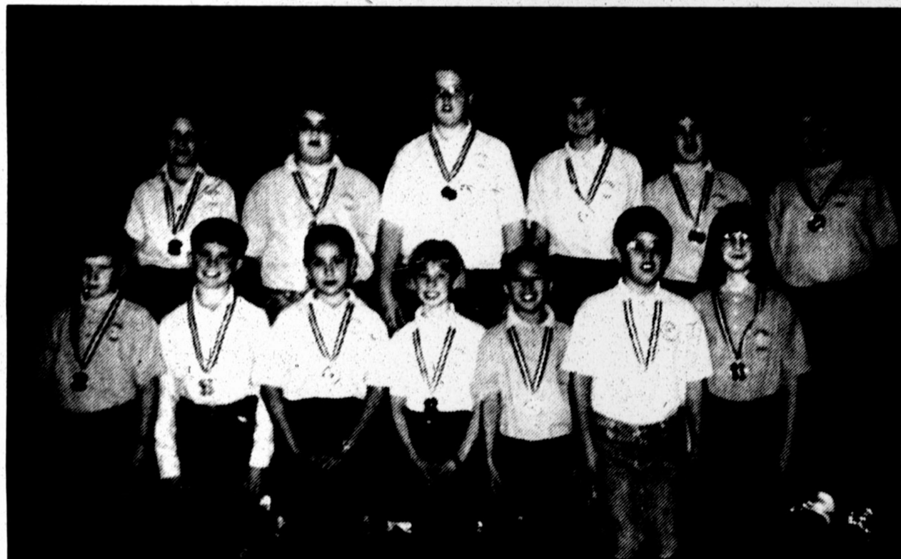
St. Anthony Science Fair, Elementary, First Place Winners