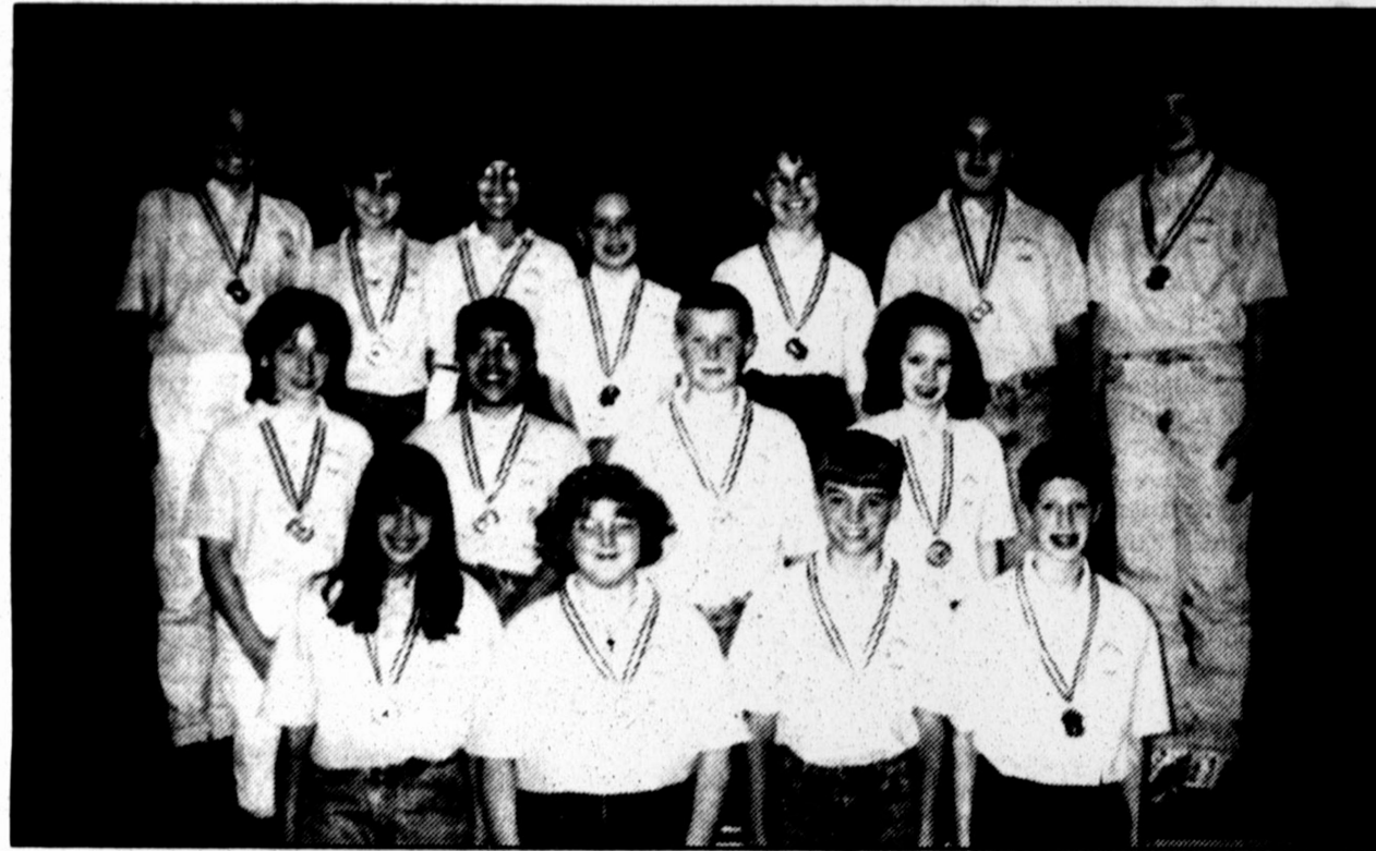
St. Anthony Science Fair, Junior Winners