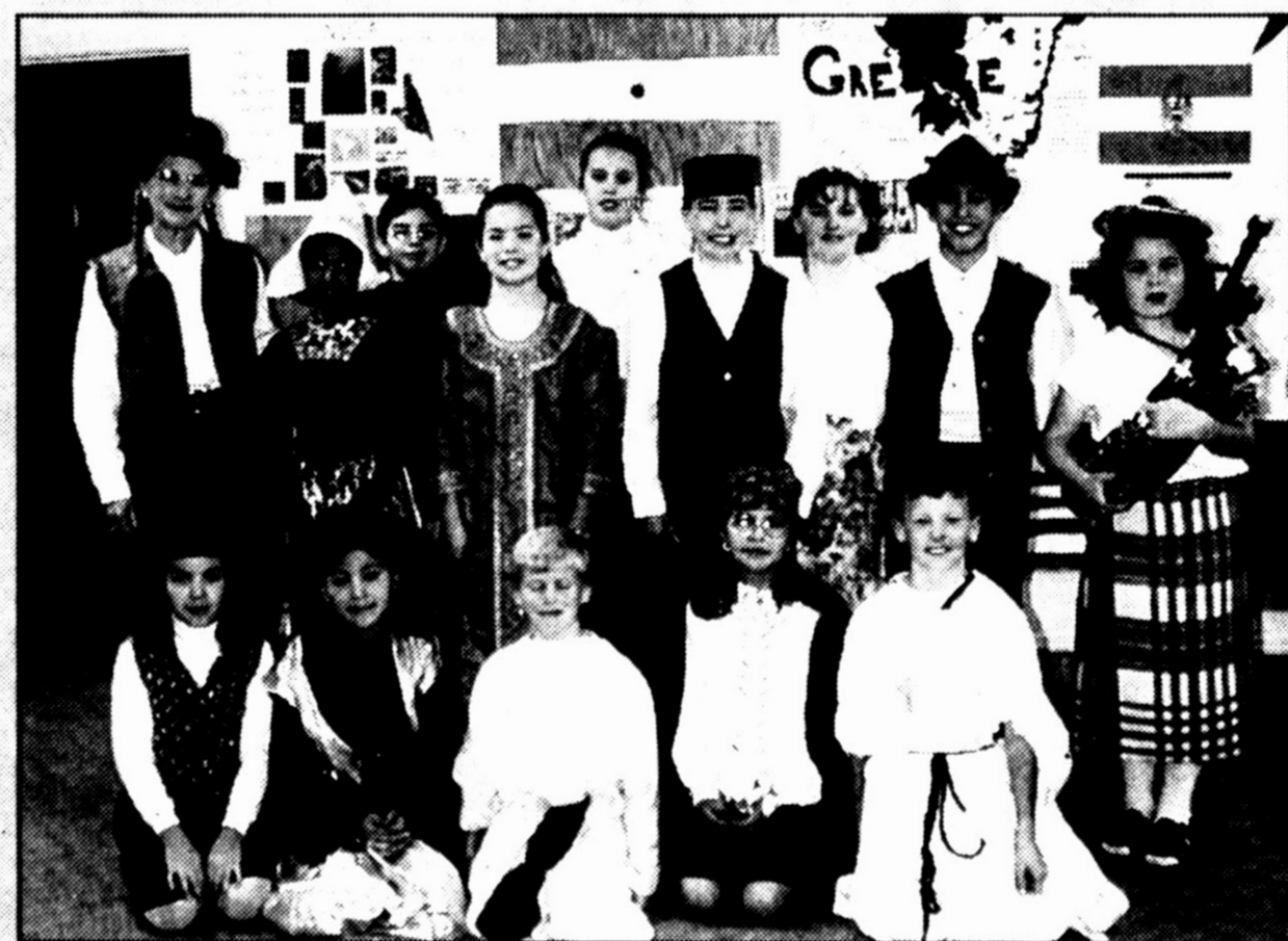
NCA fifth-grade class shows off traditional attire of other countries