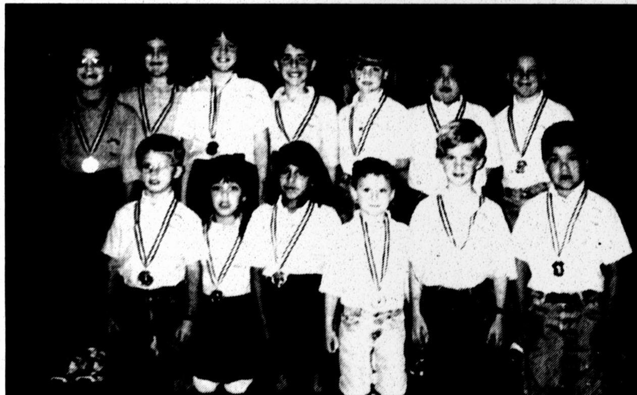
St. Anthony Science Fair, Primary, First Place Winners