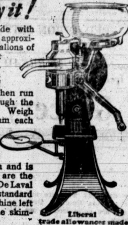
Liberal trade allowances made on old separators.

PUT a De Laval side-by-side with any other separator of approximate capacity. Mix 20 gallons of milk thoroughly and let it stay at normal room temperature of 70°. Run half through each machine. Wash the bowl and tinware of each in its own skim-milk. Then run the De Laval skim-milk through the other machine and vice versa. Weigh and test for butter-fat the cream each machine gets from the other's skim-milk. When you do this you will know beyond question of doubt that the De Laval skims cleaner, is easier to turn and is more profitable to own. Above are the results of such a test between a De Laval and another new separator of standard make. Note that the other machine left 25 times more butter-fat in the skim-milk than the De Laval did.