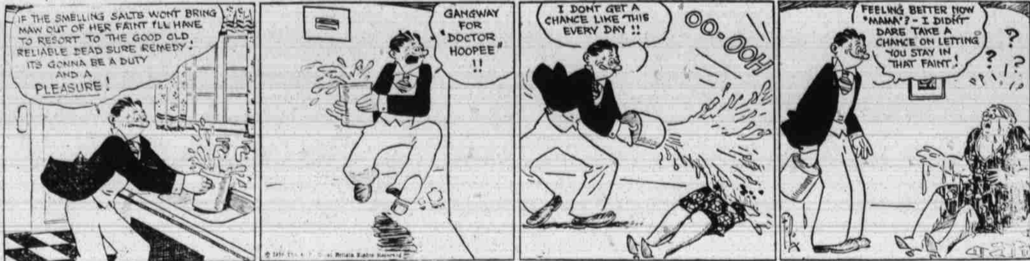
(This Is What He Was Doing December 3, 1930)

...and what will be the predicament of "Pa's Son-in-law" on Labor Day, 1931