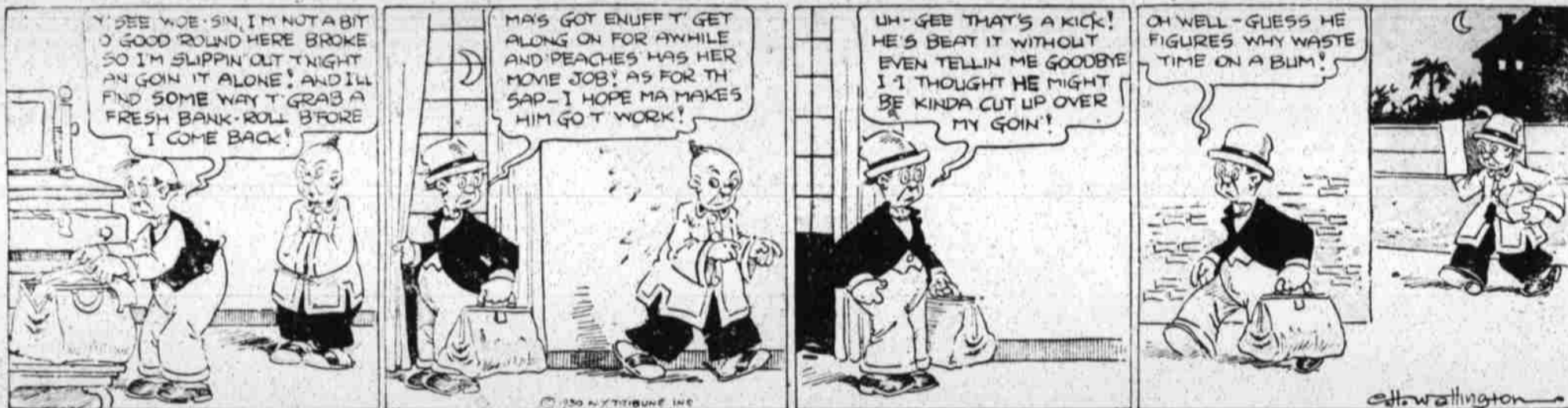
(This Is What He Was Doing December 3, 1930)

...or what will be "The Water Bucket" comment on the World Series?