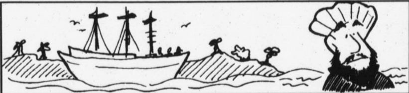
Vasco Da Gama sailed around the Cape of Good Hope in Africa to India in the late 1490s. His voyage opened up the first all-water trade route between Europe and Asia.