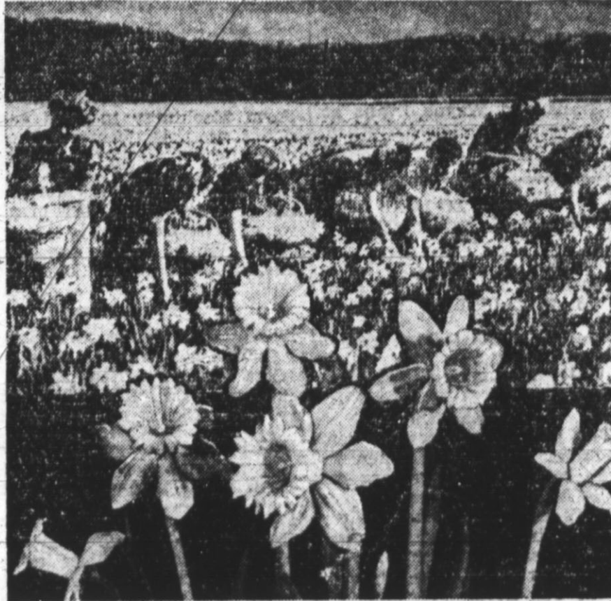
Spring comes marching in on March 21, and close upon its heels will follow the Puyallup Valley daffodil festival, at Tacoma, Wash., March 26-30. The event will include a spectacular parade in which about a half a million blooms will be used. The above scene depicts daffodil time in Puyallup valley.