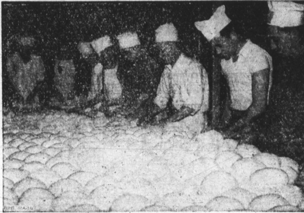
It may not be like mother used to make but it keeps her boys in the Army going strong. Such bread as that made in U. S. Army field kitchens, shown above, is one big reason why our military forces can well travel on their stomachs. Soldiers in the camps get plenty of this "staff of life" which after being baked lands on their plates in plentiful thick slices.