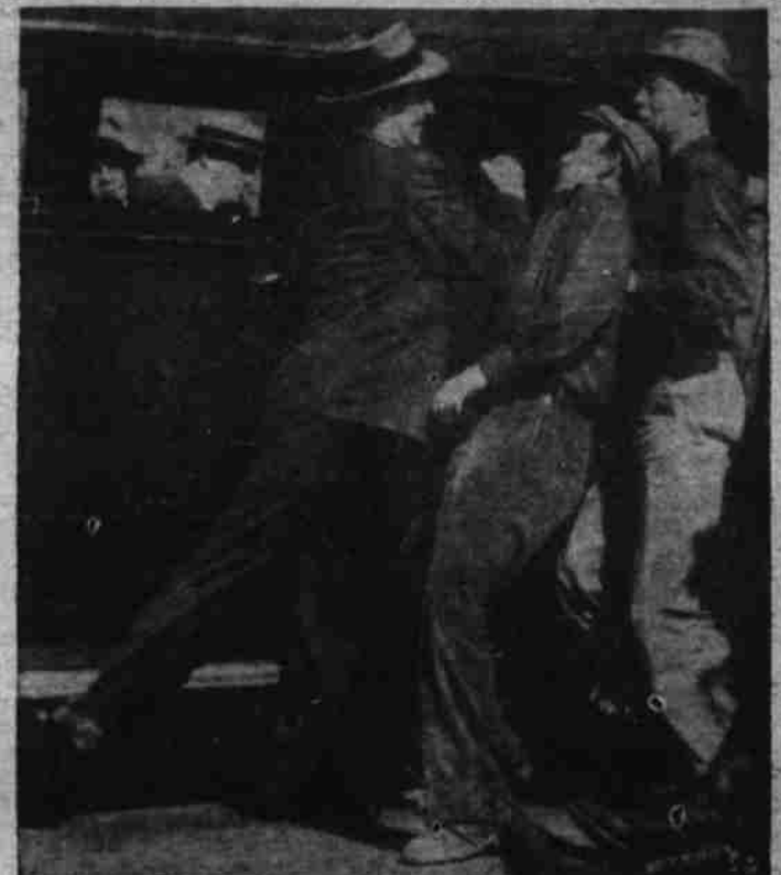
'BEAUTIFUL BOB' TAYLOR (left) turned into a brulking brawler for "toughest scene in recent film history" at Culver City, Cal., and didn't even lose his hat.