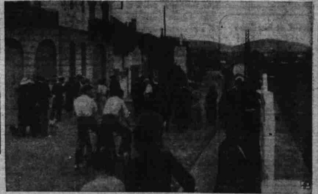
SPANISH WAR, FOUGHT BY ITALIANS , and Germans, spells new war scare for France who has garrisoned 70,000 troops on Spanish border. Late in 1936, bombs from a Spanish plane fell on French Briston (above), drawing crowds to streets. In distance are Spanish mountains.