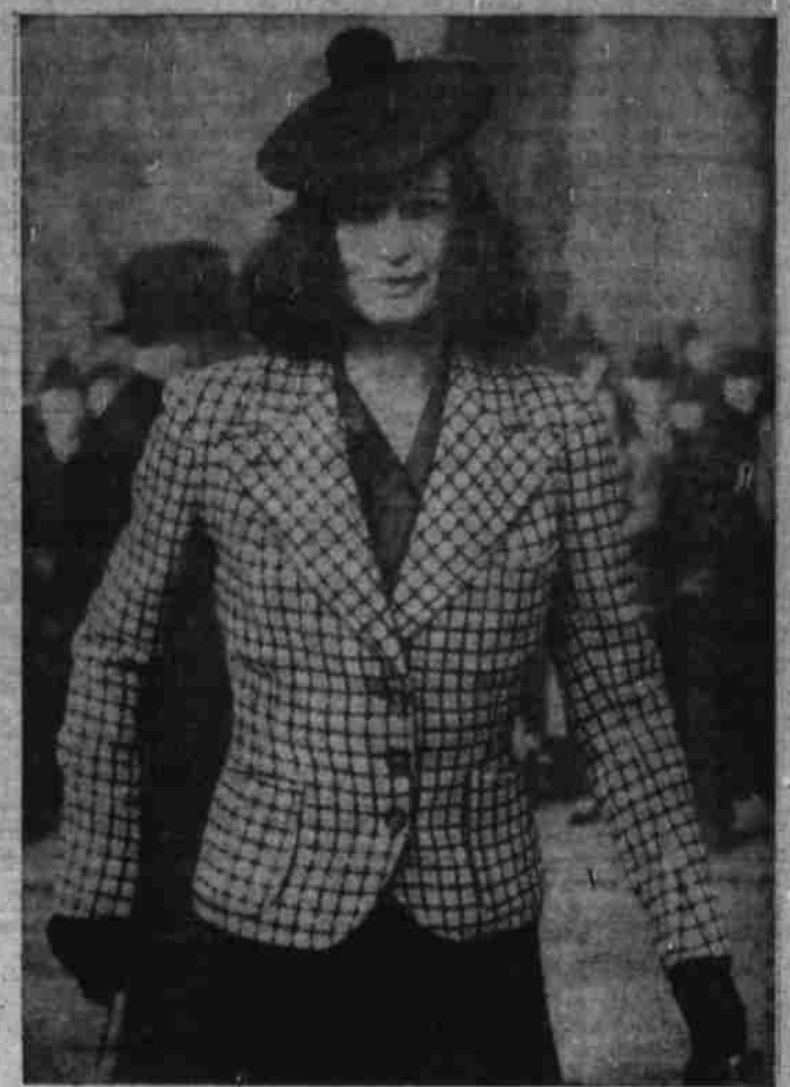
TIGHT-FITTING SCOTCH costume topped with a tam was worn by British girl strolling in London's Hyde park.