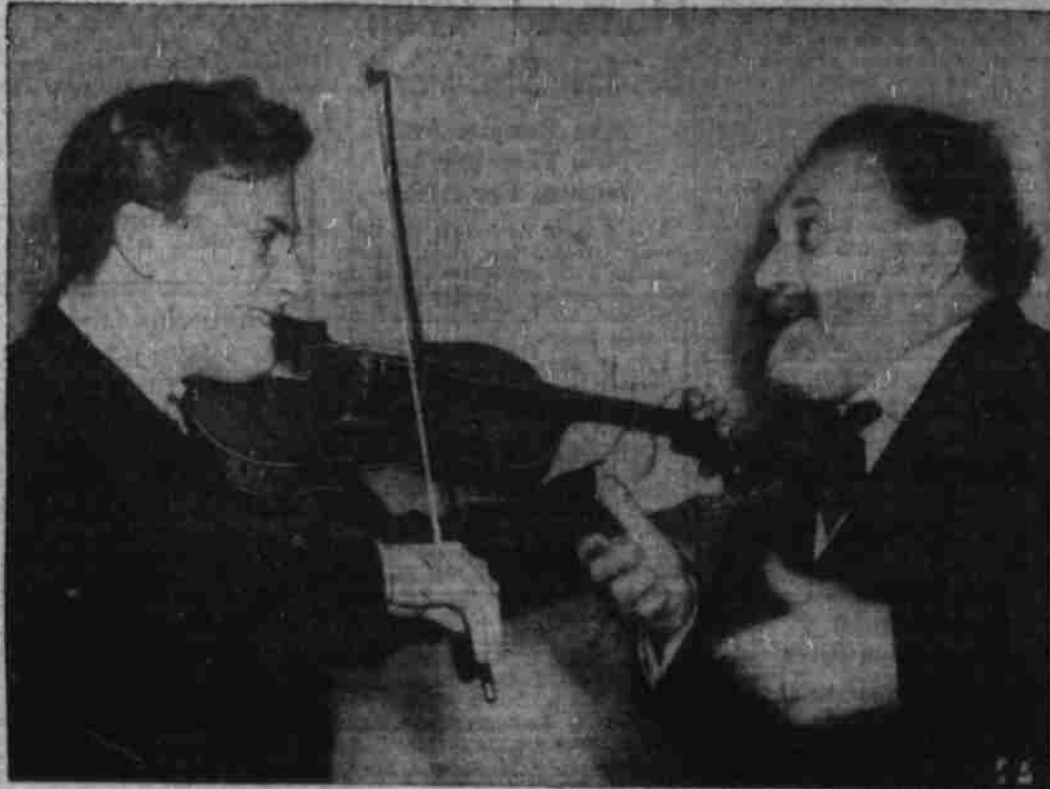
WITH HANDS ACROSS THE SEA , Yehudi Menuhin (left), 21, played the much-discussed "lost" concerto of Robert Schumann at Albert hall in London, using his $60,000 Stradivarius. The young violinist, who is a favorite with American music-lovers, played this "lost" concerto for the first time in United States at the St. Louis symphony concert in December. Above, Sir Henry Wood, conductor, lifts hands expressively, compliments Menuhin's playing.