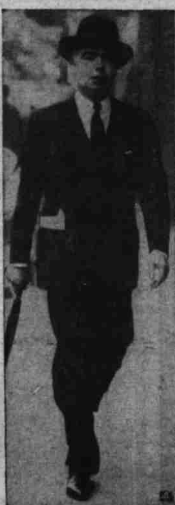
VIGOROUS foreign policy with support for Czechoslovakia and firm stand on Spain is necessary, contends Britain's war secretary, Horne-Belisha.