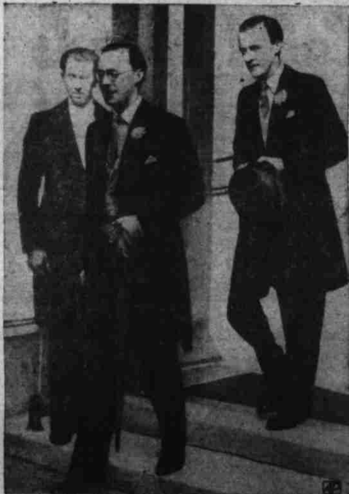
FIT FOR A KING TO SEE were Prince Bernhard (foreground), husband of Dutch Crown Princess Juliana, and his brother, Prince Ernst von Lippe-Biesterfeld, leaving for luncheon date with King George at Buckingham palace. During this London visit, Prince Bernhard visited cafes, did a rumba.