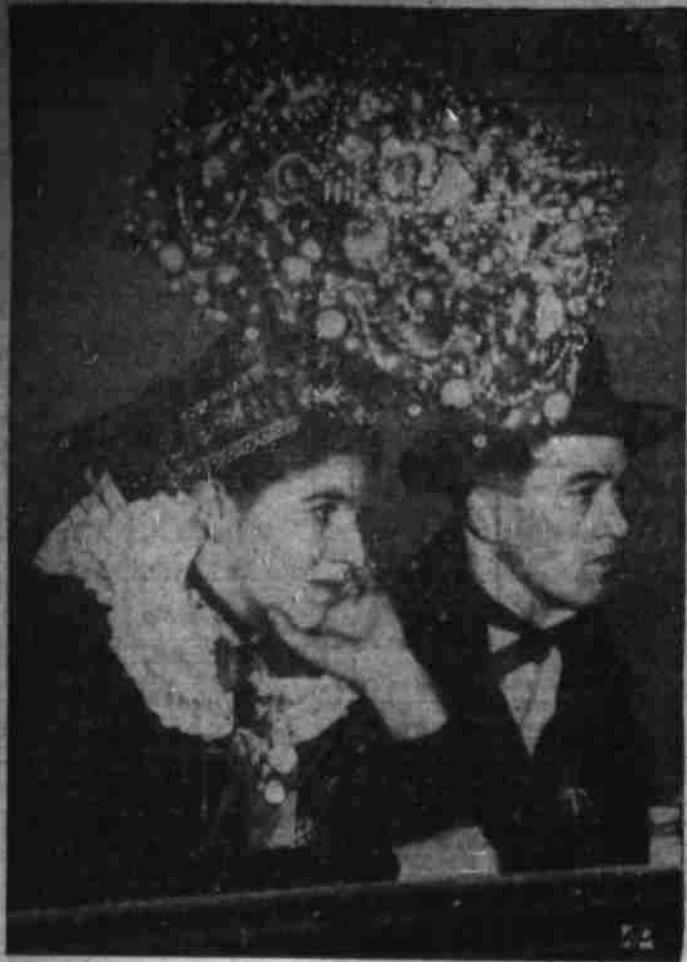
WEDDINGS HAVE WEIGHT In Germany's "Black Forest" where peasant girls wear this huge bridal head-dress, using a half hour to put it on. This girl doesn't have marriage in mind, however. With some hundred peasant dancers, she came to London, England, to perform at a fete in Albert Hall.