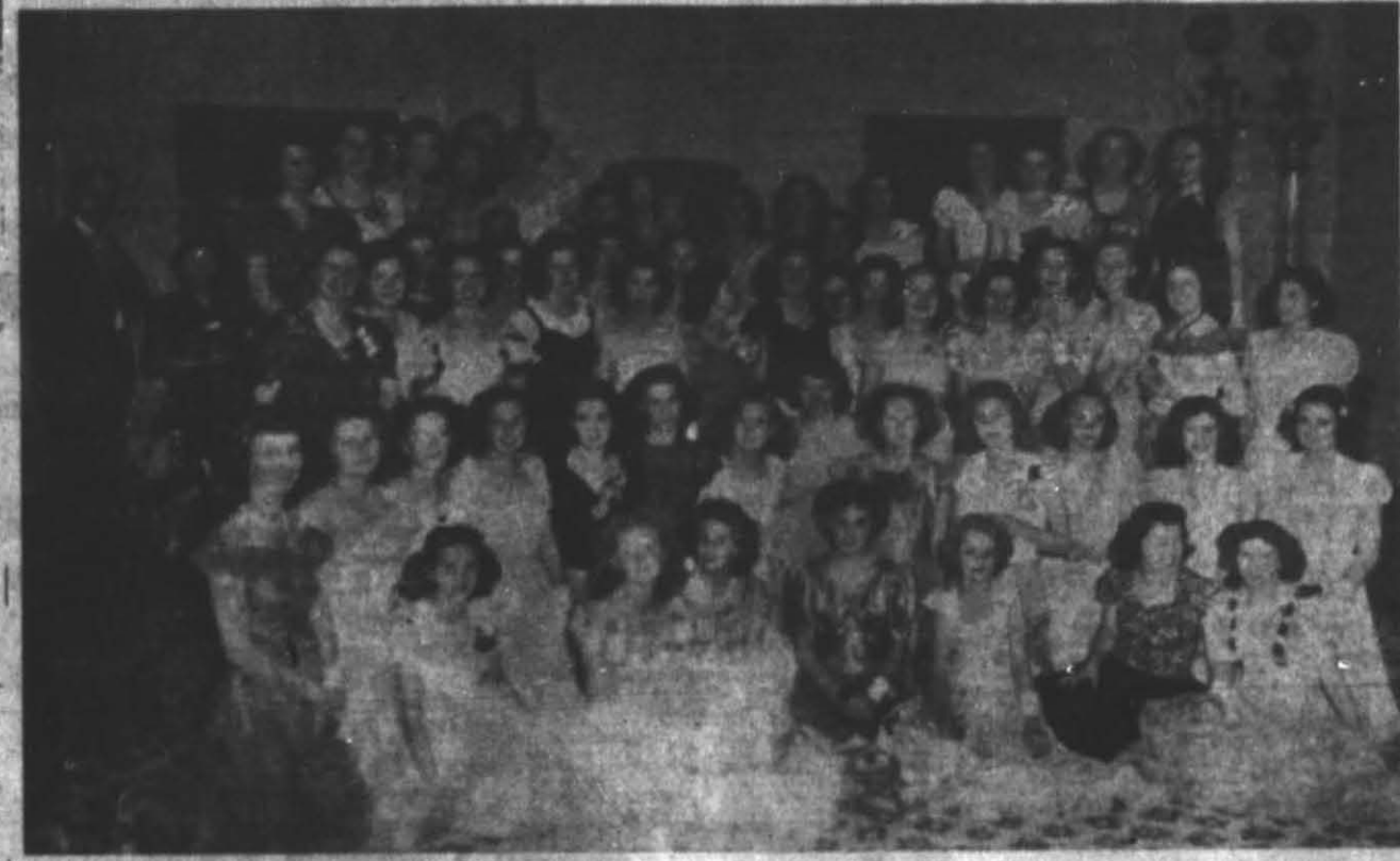
Pictured above are the charter members of the Hereford chapter of the Order of the Rainbow, formed here last Saturday night, with their sponsors from the OES and Masonic Lodge. At left is a part of the delegation from Amarillo Rainbow chapters which instituted the local order. (See Story on Page One, Section 2.)