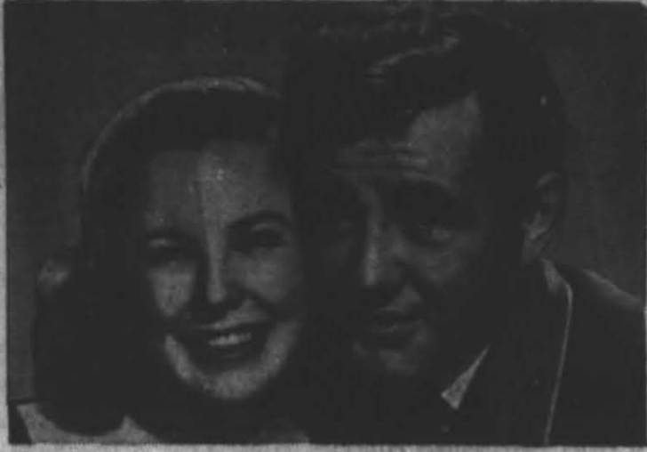
June Allyson and Robert Walker are the happy pair teamed in an hilarious picture of married life, "The Sailor Takes a Wife" coming to the Star Sunday.