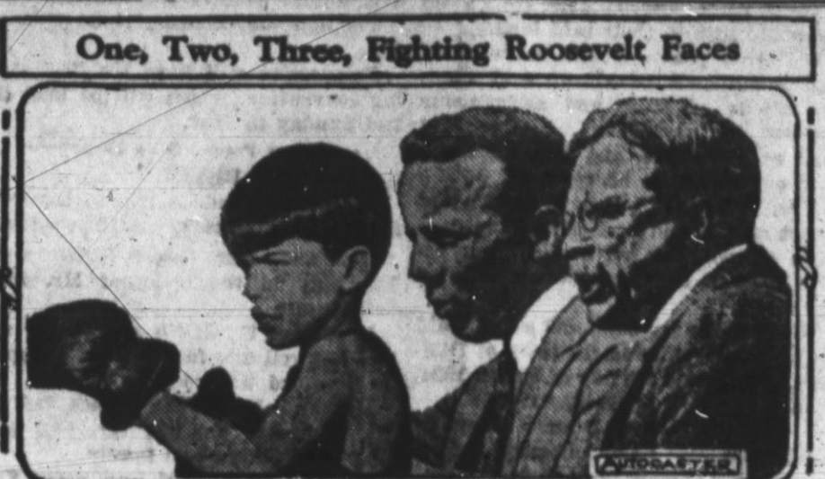
Young Teddy III has taken up boxing at Washington "and he's a chip," says the instructor. Arranged here with photos of daddy Theo. II and grand-daddy T. R. he runs true to form.