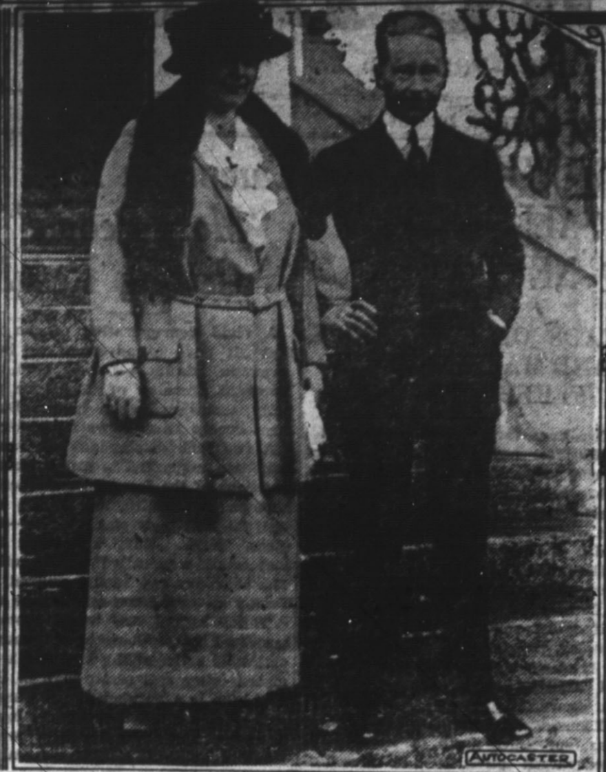
Here is the first and exclusive picture of the German former Crown Prince at home again. With him is his wife, who stayed in Germany through his five years of exile in Holland. This picture was taken at Oels, where they are now living in his castle there.