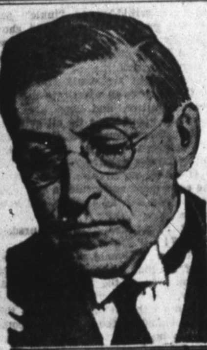
OWEN J. ROBERTS