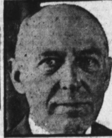
Theo. Roosevelt, Jr., Ass't Sec'y of Navy, and E. C. Finney, Ass't Sec'y of the Interior, who also served under former Sec'y Albert B. Fall, are expected to resign their posts now that Denby has stepped out.