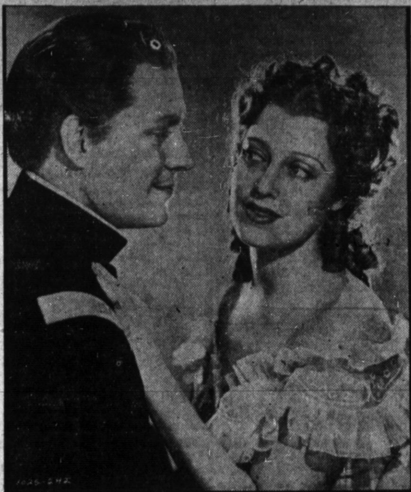
Nelson Eddy and Jeanette MacDonald are co-stars for the fourth time in "The Girl of the Golden West," which opens at the Star Theatre for the midnight prevue Saturday and shows through Sunday and Monday.