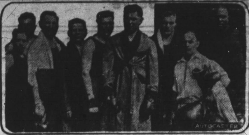
Champion Jack Dempsey is here shown with his trainers in his camp on the outskirts of Great Falls, Mont., where on July 4th, he will defend his title against Tom Gibbons, of St. Paul. Dempsey is now into heavy training.