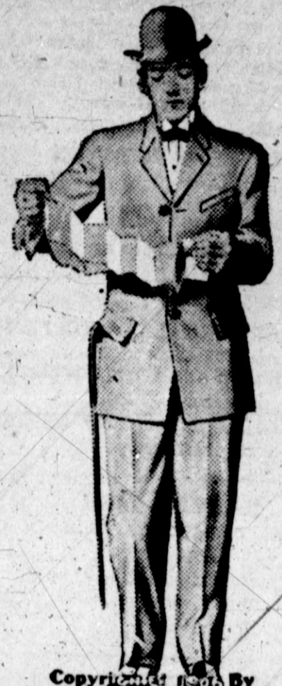
Copyright 1906 By SCHOOLS BROS. & CO. Fine Clothes Makers Baltimore and New York

As a compliment to our many patrons and the public generally, for a short time, we propose to give to every customer making Cash Purchases to the amount of $20.00, a handsome three quarter, life size, Crayon, Sepia or Water Color Portrait FREE. To this end we have made a contract with one of the leading portrait houses of America, to furnish us with their celebrated portraits. Remember you are not required to buy a frame. We are presenting you the portrait as an appreciation of your patronage. However we shall carry a large line of Frames which we will sell to portrait customers at wholesale price. If you can buy a frame cheaper elsewhere, you may do so.