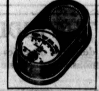
The Sight Meter measures light. Under the Better Sight lamp it registers 20-30 footcandles—the right light for studying.

developed. It certifies that the Electrical Testing Laboratories, famous engineering organization in New York, has made exacting tests and found that the lamp bearing it conforms to the new sight-saving specifications. Let this tag guide you to the new lamp designed to save eyes.