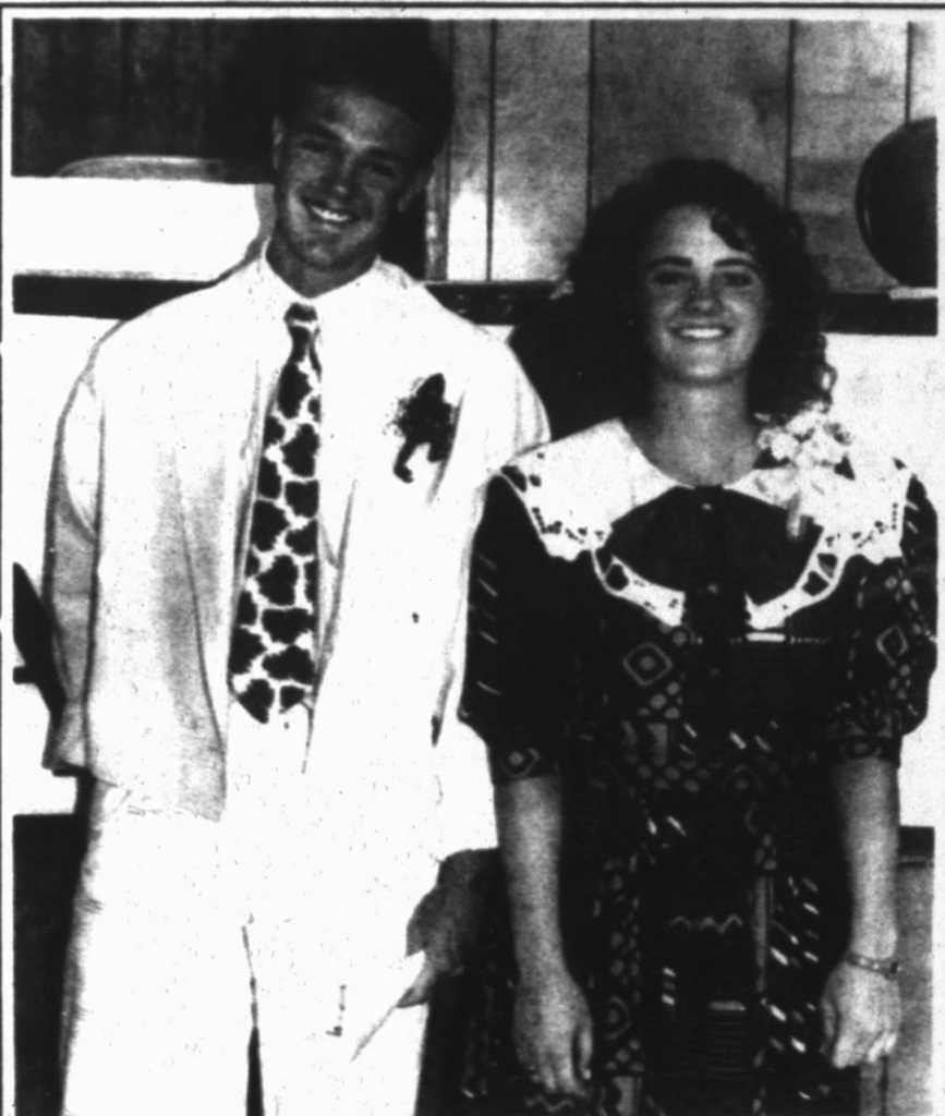
Athletes of the year

Pay at the Lenin shipyard averages $106 monthly.