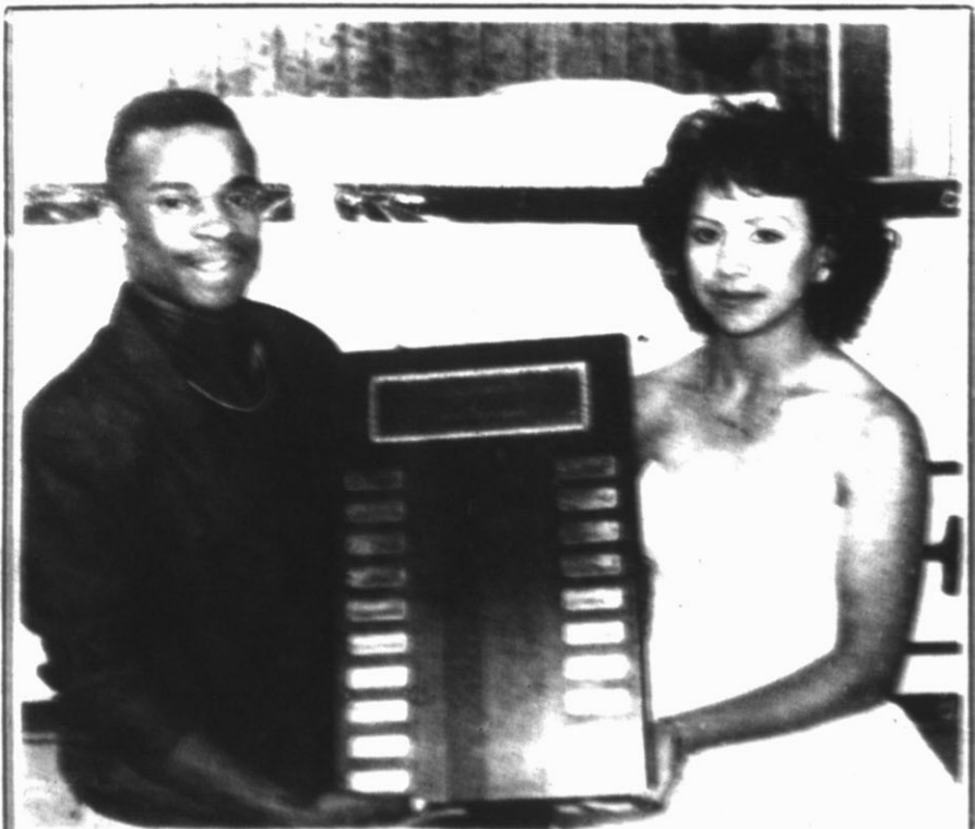
"Fighting Heart" award winners