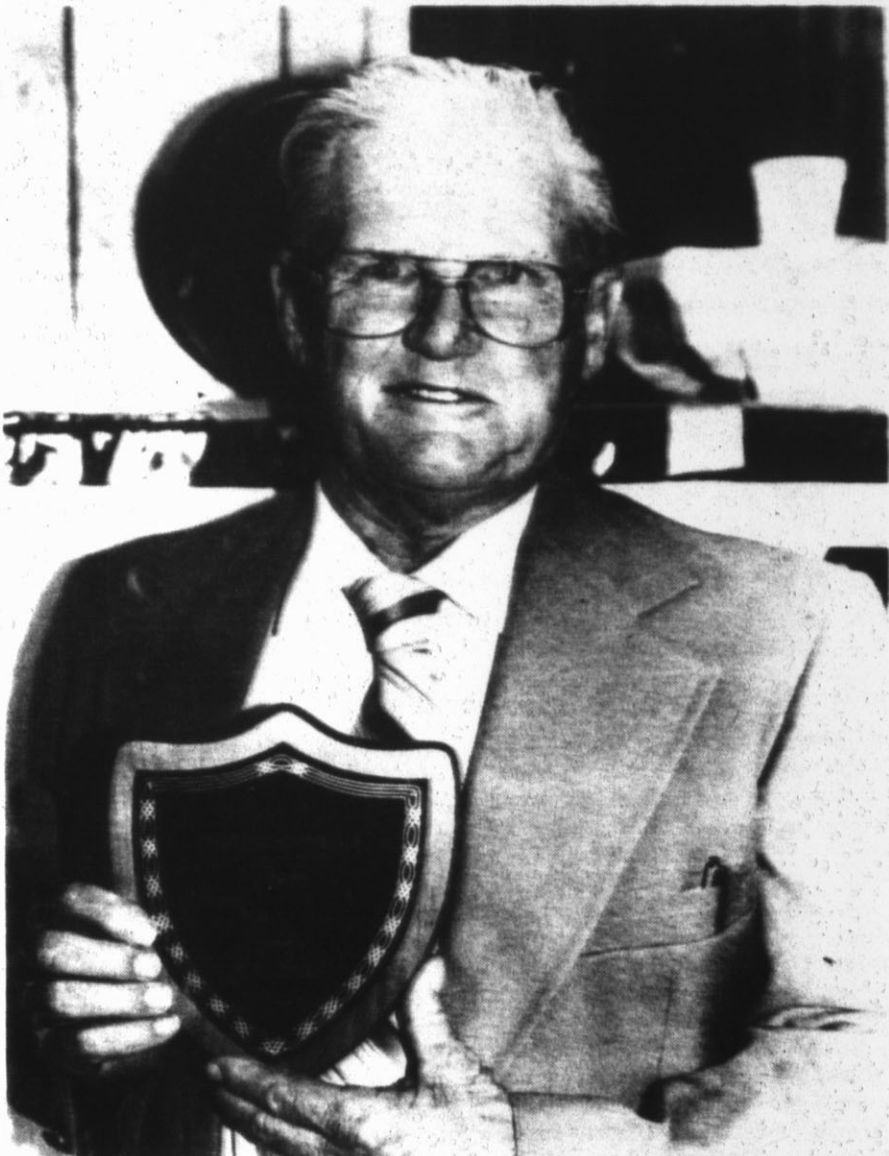
Fan of the year