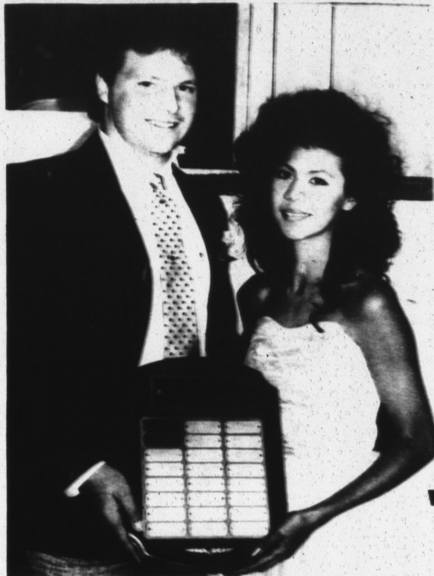
Casey Smith Memorial Award winners