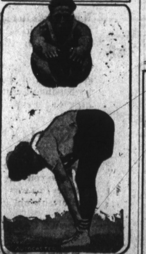
Willie Trene, athlete, recommends touching the hands with toes while six feet in the air in a broad jump, as a cure for stiff back. Try it.