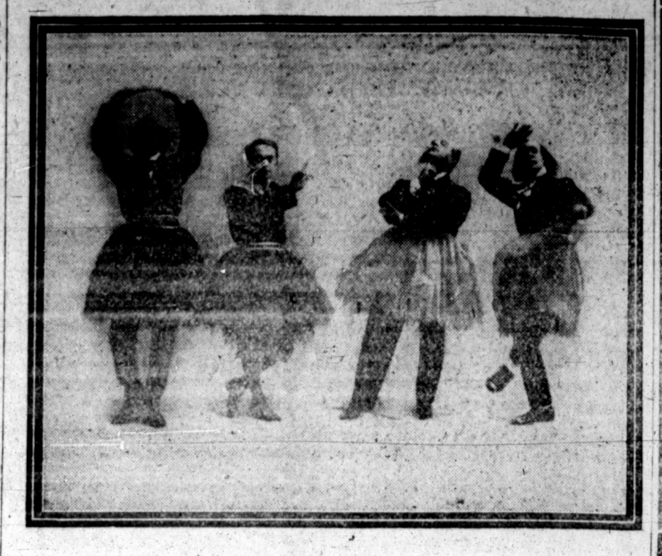
COMEDY QUARTETTE IN "MA'S NEW HUSBAND" Opera House, Thursday Night, January 7.

Ir you think the Panhandle is not what we say it is just call on us. The latch string always hangs out. We will show you a city that is the brightest gem that crowns the brow of grand old Texas, as George Bailey puts it. We will show you a country that is so filled with wonderful possibilities that you can almost feel the tingle of the blood as it leaps to connect withthe physchic waves that connect ambition with accomplishment. We will show you air so pure that you can almost see the germs leaving the system, and we know that you can feel a wonderful life creeping into the veins made sluggish through years of depressing surroundings. And after we have shown you these things we wil show the greatest things of allthe prettiest girls, the handsomest and stateliest women, and the most gracious old dames that you have ever met. When the women of the Panhandle are mentioned the men remove their hats, and when one is spoken to the tone is low and tense with reverence. Why, actually, we have women here whose