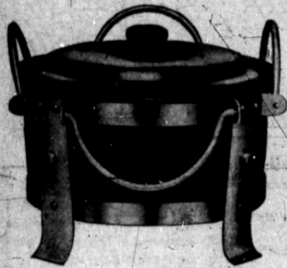
PREMIUM NO. 1

Unlike a contest, where only a few lucky persons can win, these many and beautiful things may be earned by any one. It required but little effort.