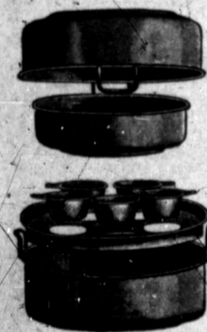
PREMIUM NUMBER 4

Given with one subscription for $2.50; or given free for 11 subscriptions.