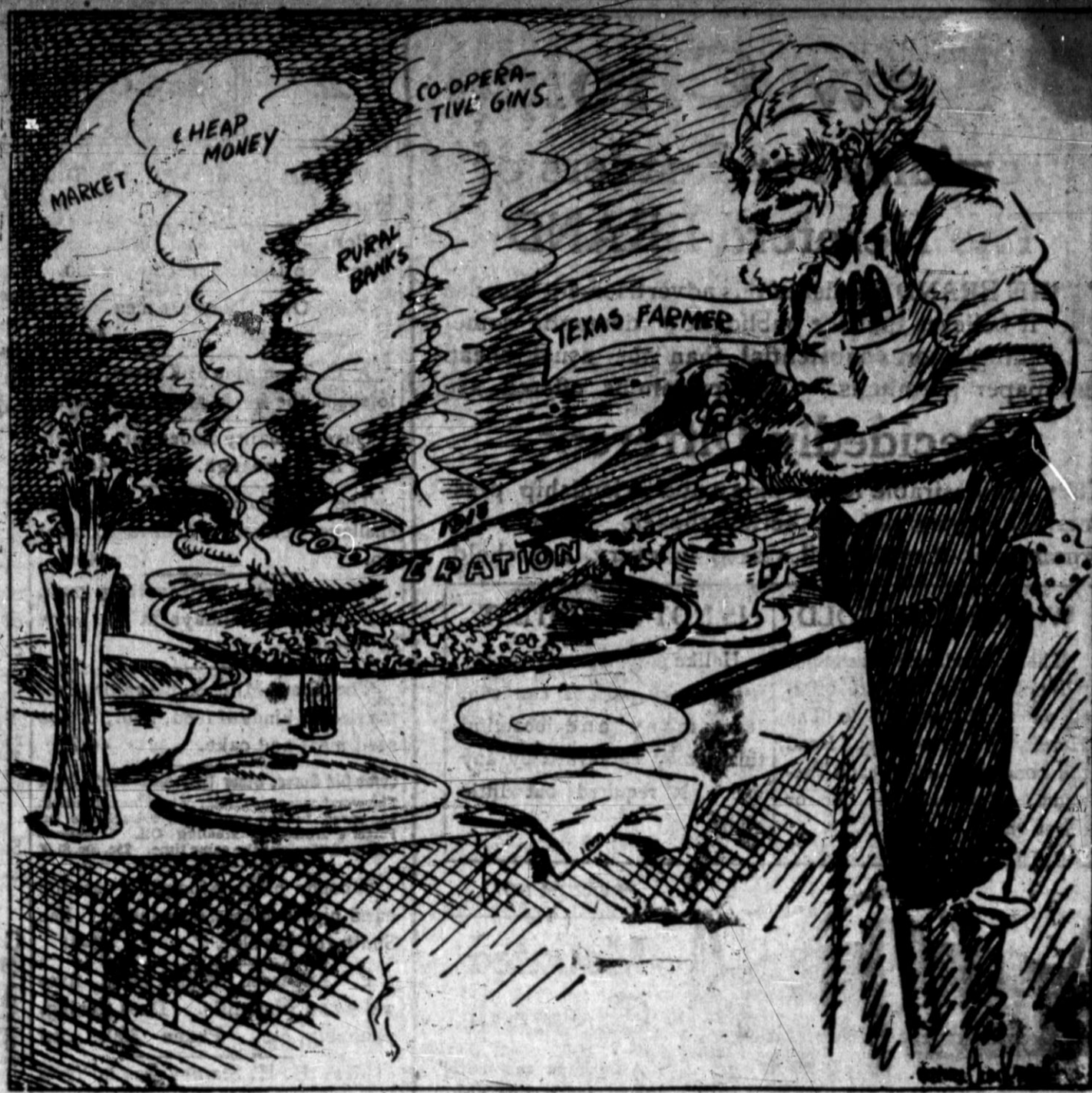
HIS CHRISTMAS DINNER.

Buy a can of Calumet Baking Powder at once, and use it in your Holiday Bakings, making your Christmas Cakes as good as the President's.