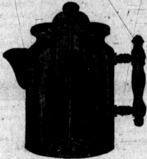
PREMIUM NUMBER 3

Given with one subscription for $2.00; or given free for nine subscription.