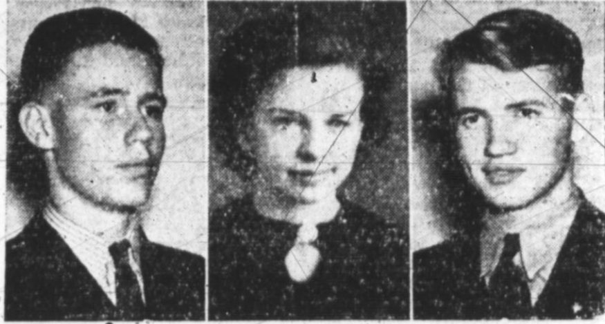
CANYON—Pictured here are the officers elected by the Panhandle High School Press Association in its recent annual convention at West-Texas State College.