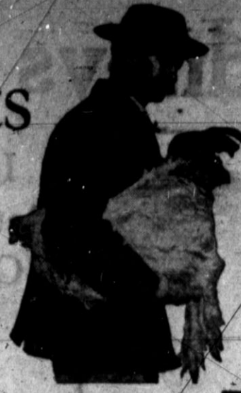
Is this cock properly held? "Poultry Secrets" tells how to carry fowls, and other secrets far more important.