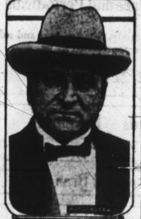
Henry Allen, former Governor of Kansas, just back from Europe on Near East Relief, is mighty hopeful for a quick recovery as agriculture and producers are diligently at work there.