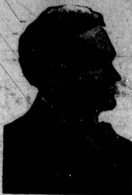
GOV. O. B. COLQUITT.

Austin, Texas, January—Governor O. B. Colquitt has called a State conference of Charities and Corrections to meet at Austin Tuesday and Wednesday, January 28th and 29th, to consider measures which will have been submitted to the Legislature up to that time, and other measures which, in the opinion of the conference, should be submitted.