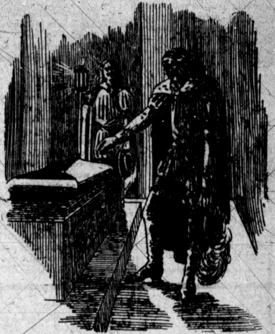
PETER THE GREAT AT THE TOMB OF RICHELIEU.

PETER THE GREAT, standing at the tomb of Richelieu exclaimed, "Thou Great Man, I would have given thee half of my dominion to have learned of thee how to govern the other half," and Peter the Great was one of the most progressive monarchs of any nation or age. The greatest rulers the world has ever produced are those who sought wise counsel from their associates and profited by the experiences of others. Knowledge is the most valuable element known in human life and to government it is the most powerful asset in civilization.