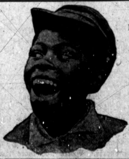
Meet me at Harrison's coal yard. 17tf