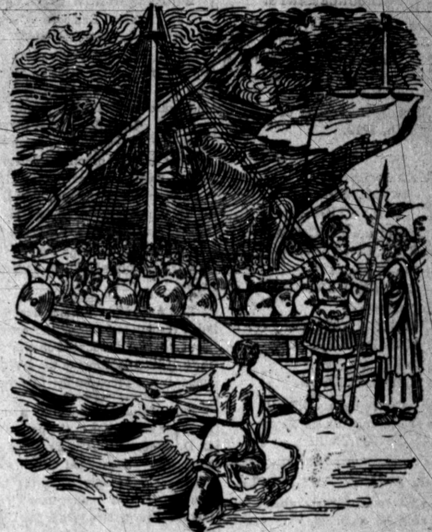
THE PATRIOTISM OF POMPEY.

DURING a famine the Roman government commissioned Pompey to procure food from foreign countries and when the expedition was confronted by an angry sea and he was urged to delay in order to avoid danger, he replied, "It is not necessary that I live, but it is necessary that I go," and he went. The human race moves forward only when it has great men to meet the emergencies of civilization and a citizenship that applauds self-sacrifice in leadership.