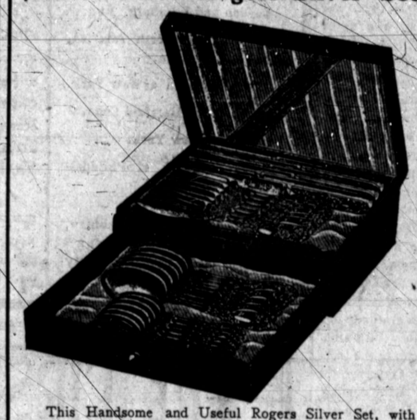
This Handsome and Useful Rogers Silver Set, with Beautiful Oak Case will be given for 60 yearly subscriptions or equivalent to The Hereford Brand and $20 in Merchant's Trade Coupons.