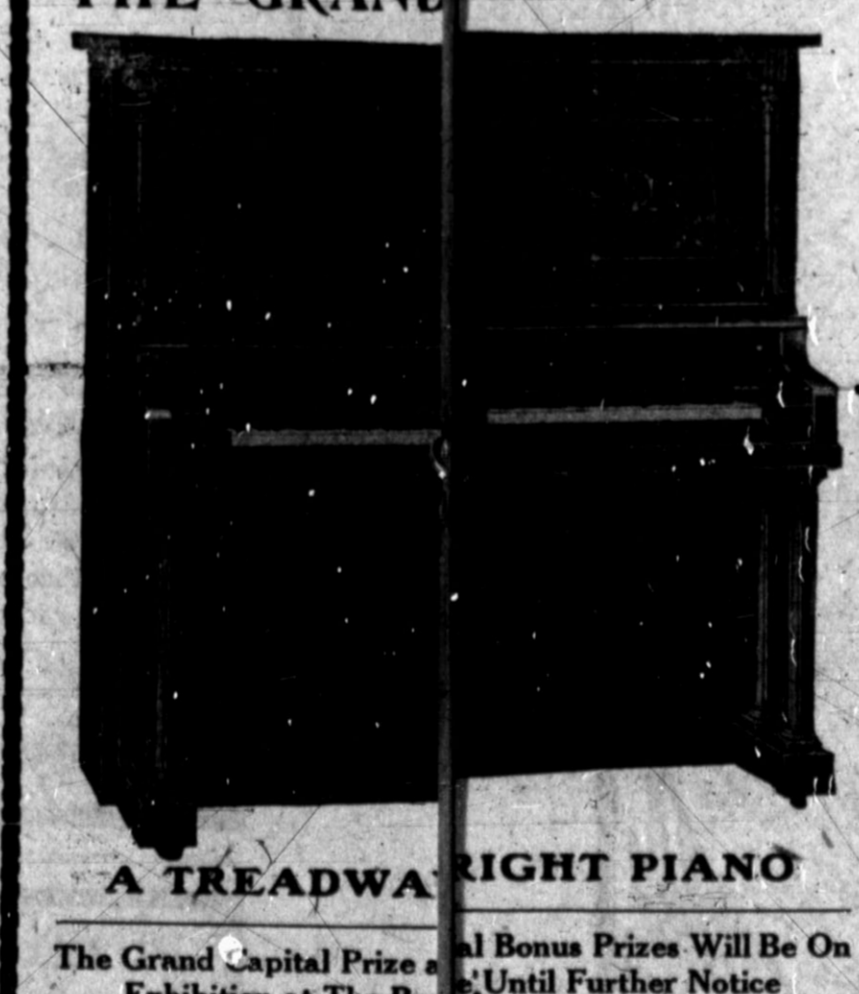
A Treadway Upright Piano

The Grand Capital Prize and Bonus Prizes Will Be On Exhibition at The Brand Until Further Notice