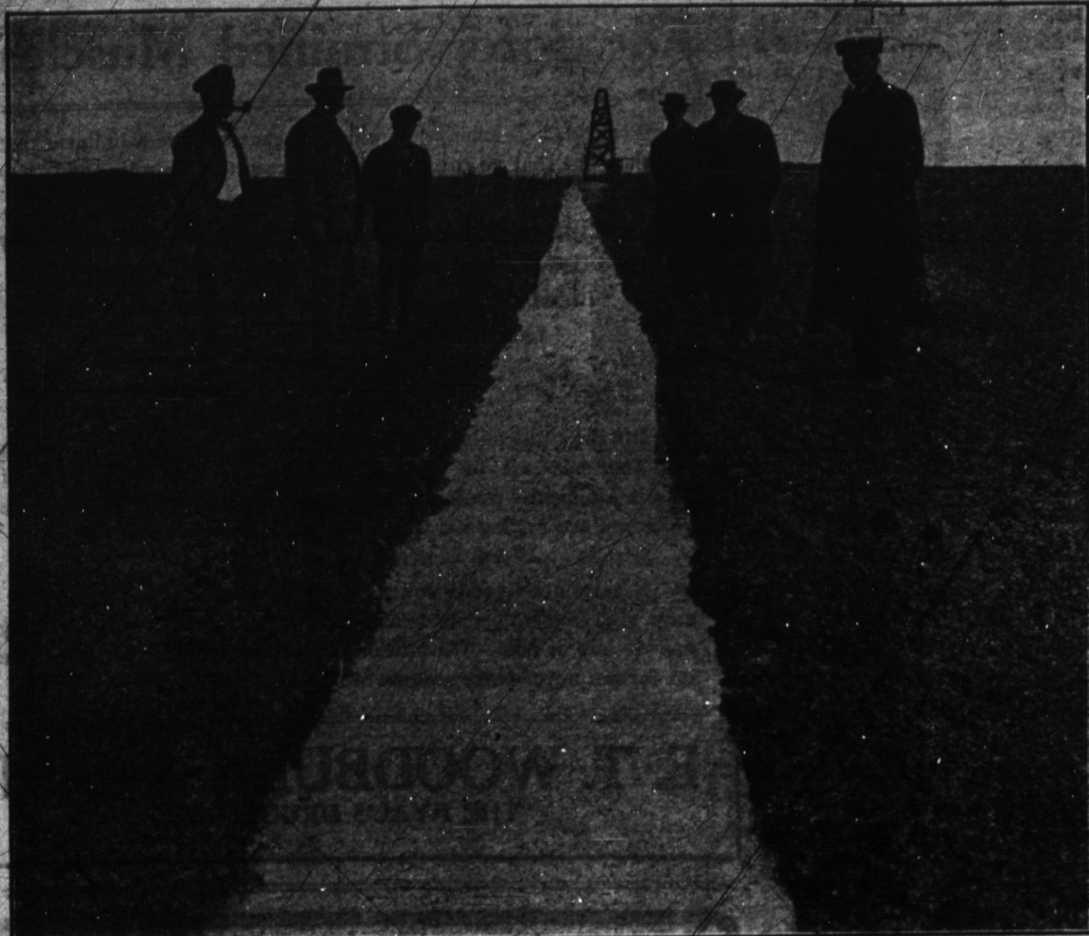
Main Canal from one of the Big Pumps—McDonald Irrigated Farms