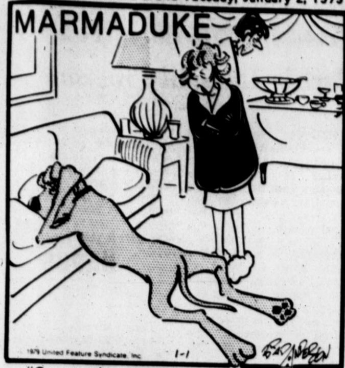
"Guess who emptied the punch bowl after we went to bed?"