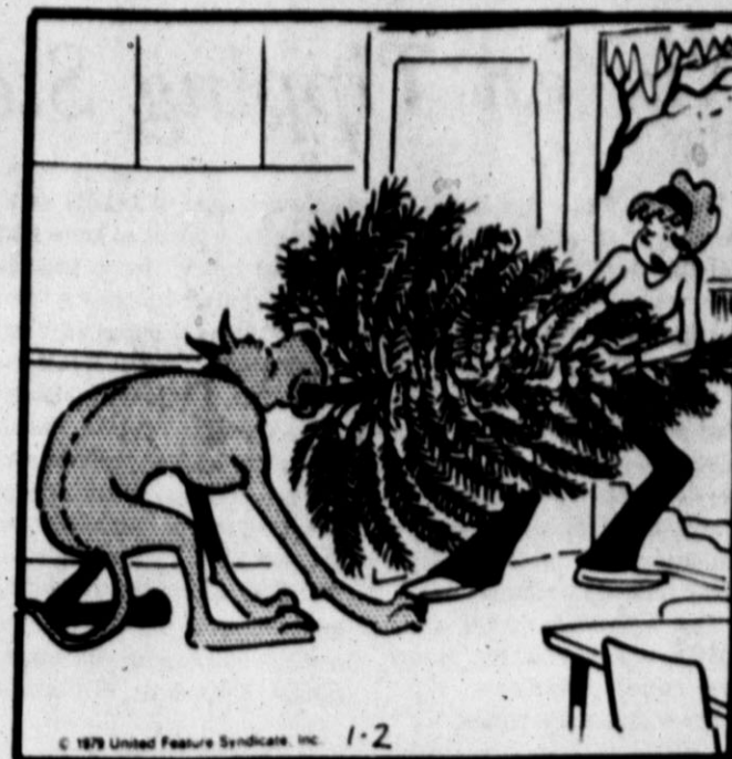
"I hate to see the Christmas season end too, Marmaduke, but..."