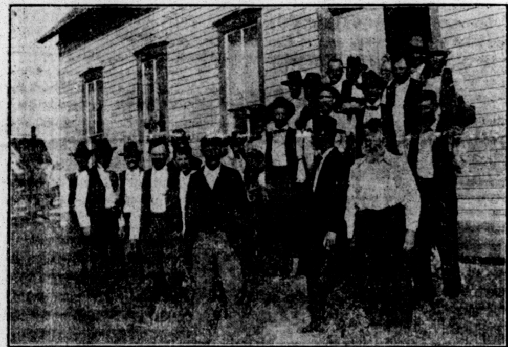
THE ORIGINAL HERD.