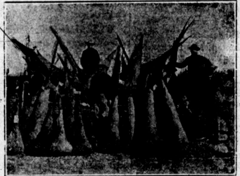
Shipping Trees by the Carload