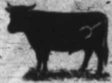
HINES & O'BRIEN Hereford, Texas