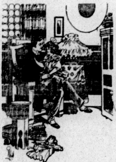
Stroked Her Golden Hair.

"Oh thank you very much, sir knight!" she lisped, "and thank you, too, for your good wishes."