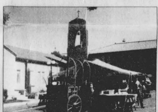
Spearman First United Methodist Church members and guests enjoyed a barbecue lunch following Sunday mornings worship services.

Back In The Saddle was the emphasis last Sunday, August 29th, at the First United Methodist Church of Spearman.