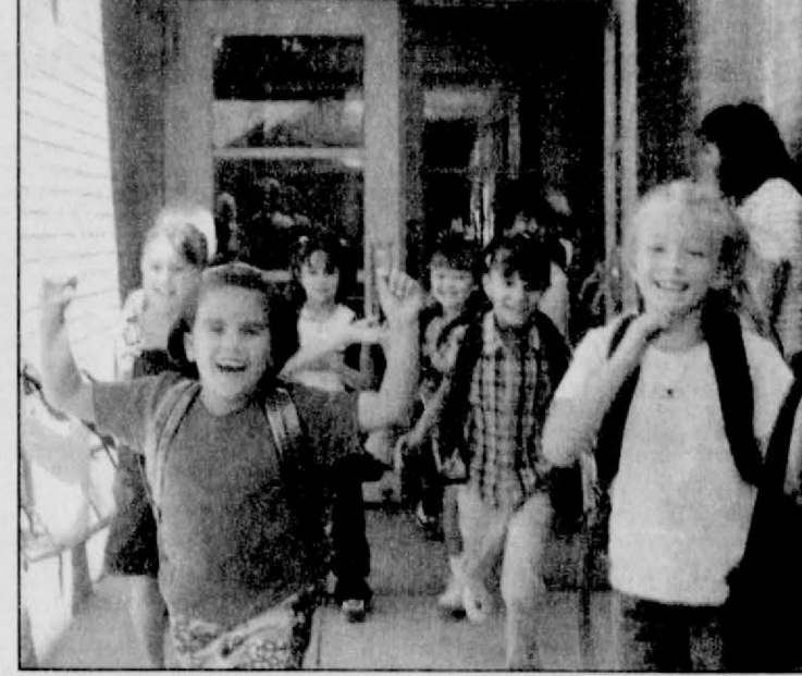
Spearman Elementary students celebrate the end of their first day