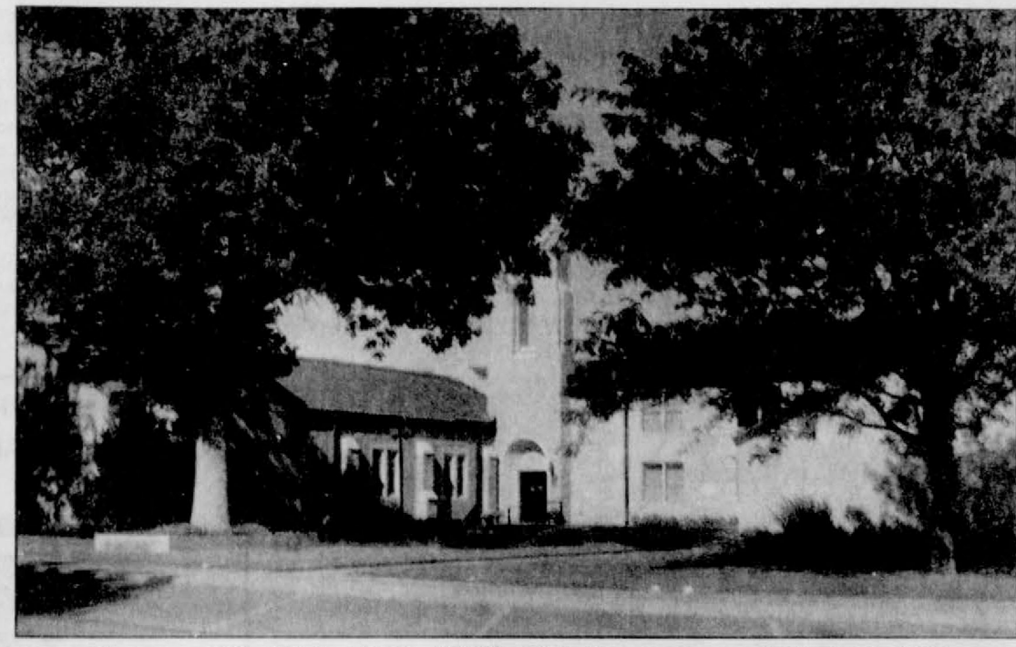
The present First United Methodist Church in Spearman was dedicated in 1950.

Please join the congregation of the First United Methodist Church on this momentous occasion where our motto is "Opening our Doors, Sharing Christ, and Making Disciples