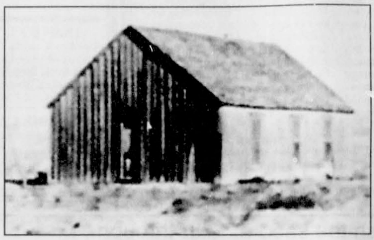
The First Methodist Church at Old Hansford

The congregation of the First United Methodist Church will celebrate their 100th anniversary on Saturday August 25 and Sunday August 26th.