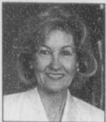
U.S. SENATOR KAY BAILEY HUTCHISON