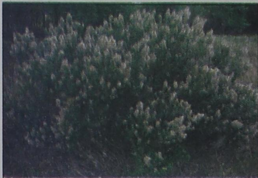
Willow Baccharis, also called Great Plains False Willow or Groundsel Tree.