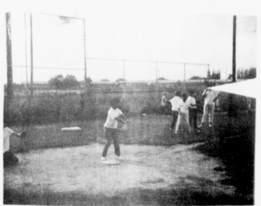
WAITING-- This young lady means business as she waits for the pitcher to hurl the ball. She is one of the players on the Damron Pill Roller team, The team play at Roger Miller Park each Wednesday and Eriday.