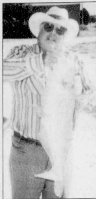
Pictured is a record-breaking 19.5 pound blue catfish caught on perch last week at the lake by Roland Harris of Perryton. The fish is being held by Pete Moncayo of Perryton. The picture is courtesy of Lynn's Bait and Tackle.

saw a spotless bobcat chasing his dog. The stubby black-tipped tail was raised, showing white underneath. That night after dark, he saw a large raccoon with two juveniles crossing the road down to the water covered bridge. The turkeys have been seen in a large flock at the Park.