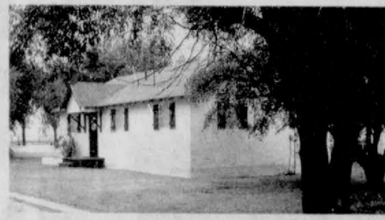
Old Hansford Bed & Breakfast 4 miles West of Spearman on Hwy. 15 3 Bedroom, 1 Bath - Country Decor Call 659-3273 for Rates.