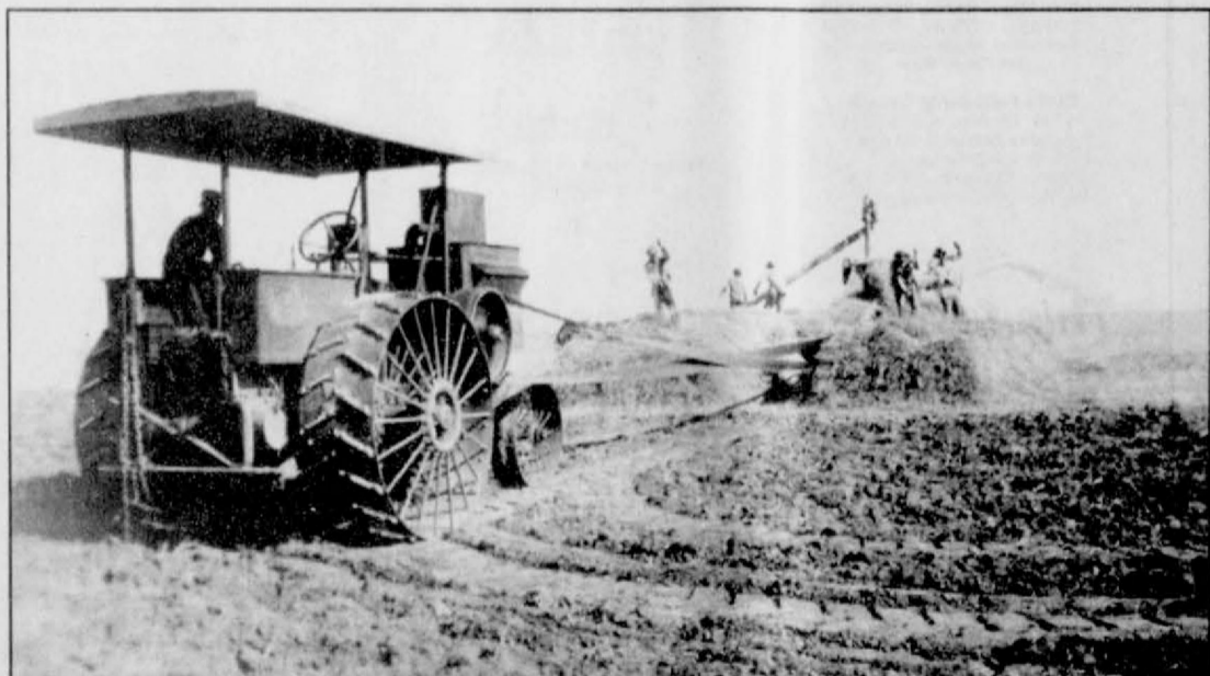
Pictured above is a steam engine at threshing time on the Lieb farm around 1913.