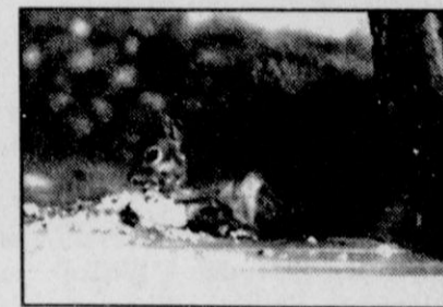
by Dorothy Hudson

Lake Depth--Nov. 10, 1997--37 ft. 9 in. - 46'