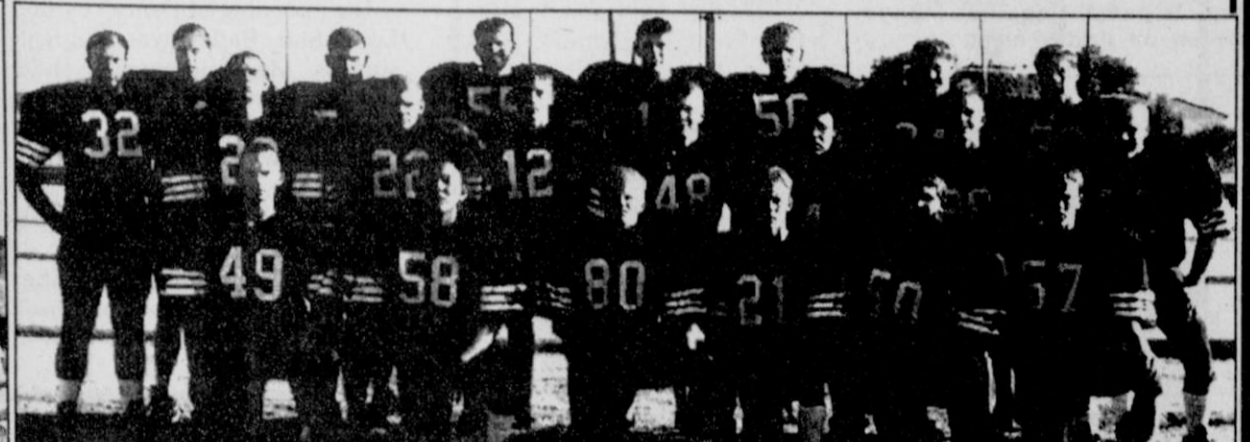
1997 Varsity Lynx