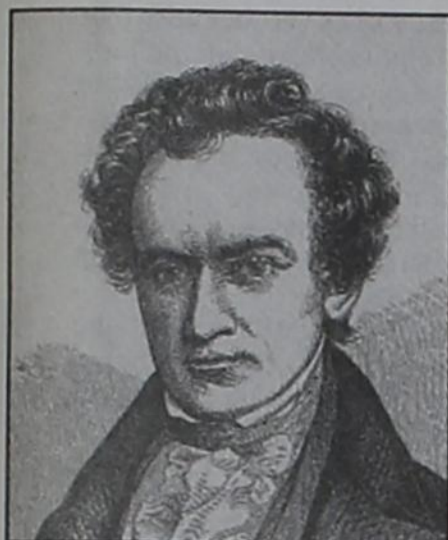
Stephen F. Austin (1793-1836)