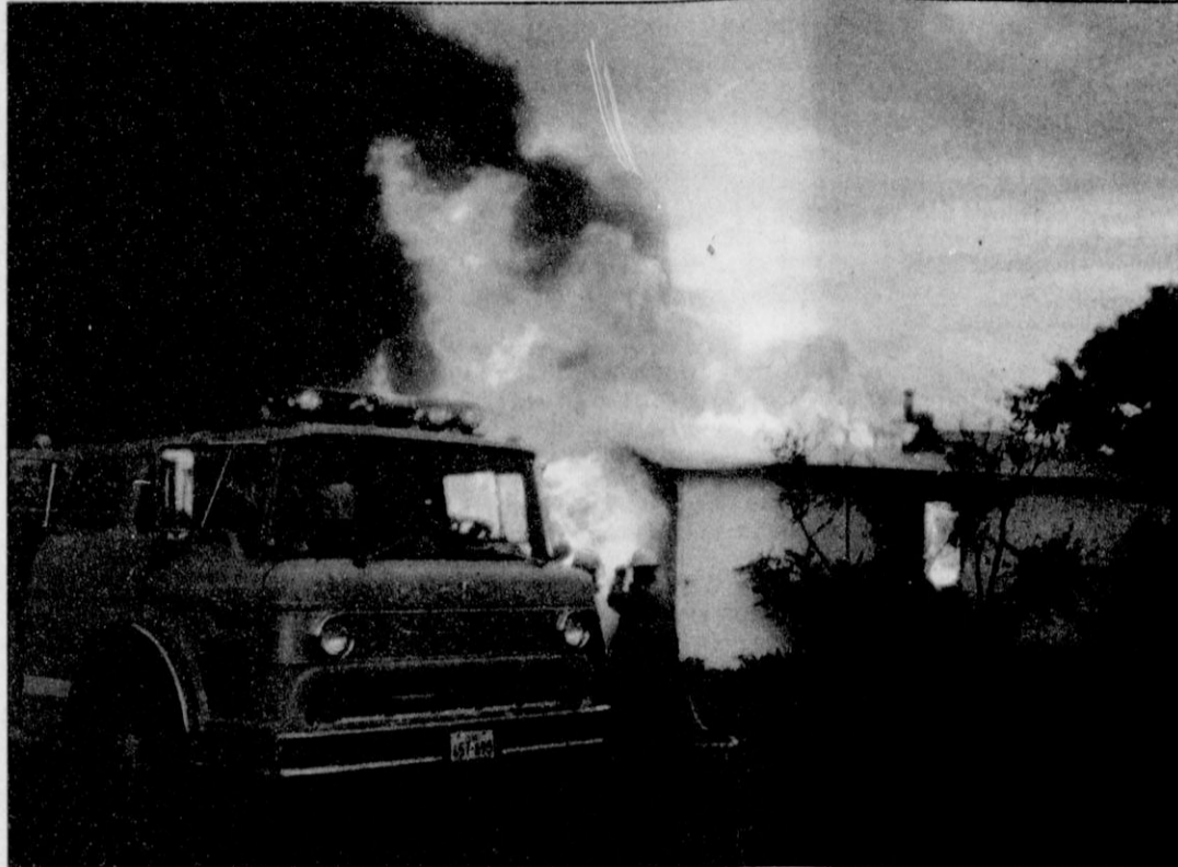
The Spearman Volunteer Fire Department burned the old Girl Scout Hut located across from the Union Church on Endicott Street.

Nominations may be made to Phil Woodall at WTAMU Box 60049, Canyon, TX 79016 or by calling him at (806) 651-4416. He can also be reached by e-mail at pwoodall@mail.wtamu.edu.