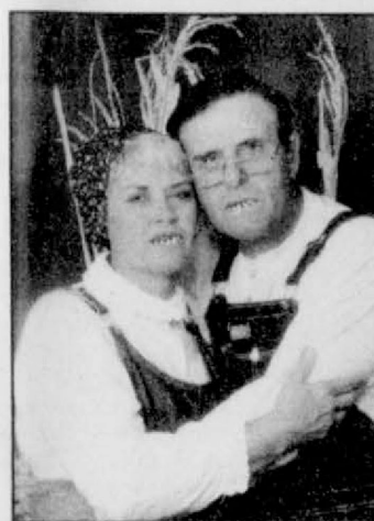
Love is Blind