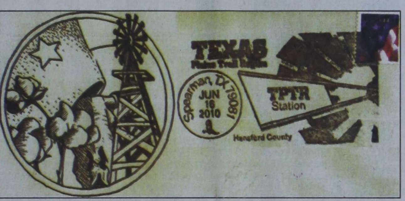
Hansford County's stamp cancellation