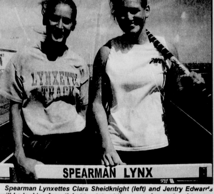
will be looking for a ticket to state at the upcoming regional tourna-