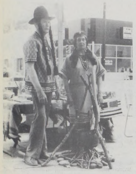
Lake Kiowa was represented at Gainesville's Heritage Days by this couple in traditional garb on a corner of the Courthouse Square.