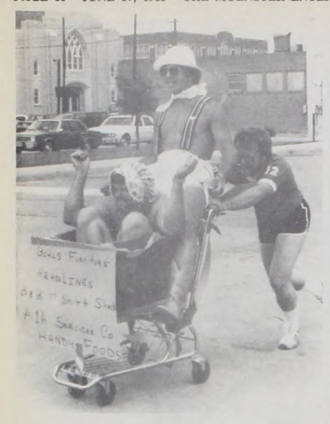
Dressed as babies? With baby boots? Two riders have a ball and one has a tough job in the buggy race at Gainesville's Heritage Days.