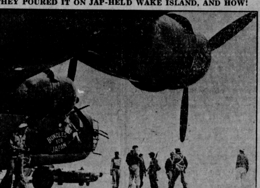
In This Corner-

THEY POURED IT ON JAP-HELD WAKE ISLAND, AND HOW!